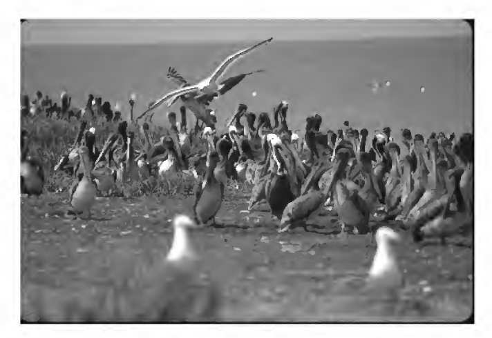
Young Brown Pelicans, Spring Island, June 19, 1999.